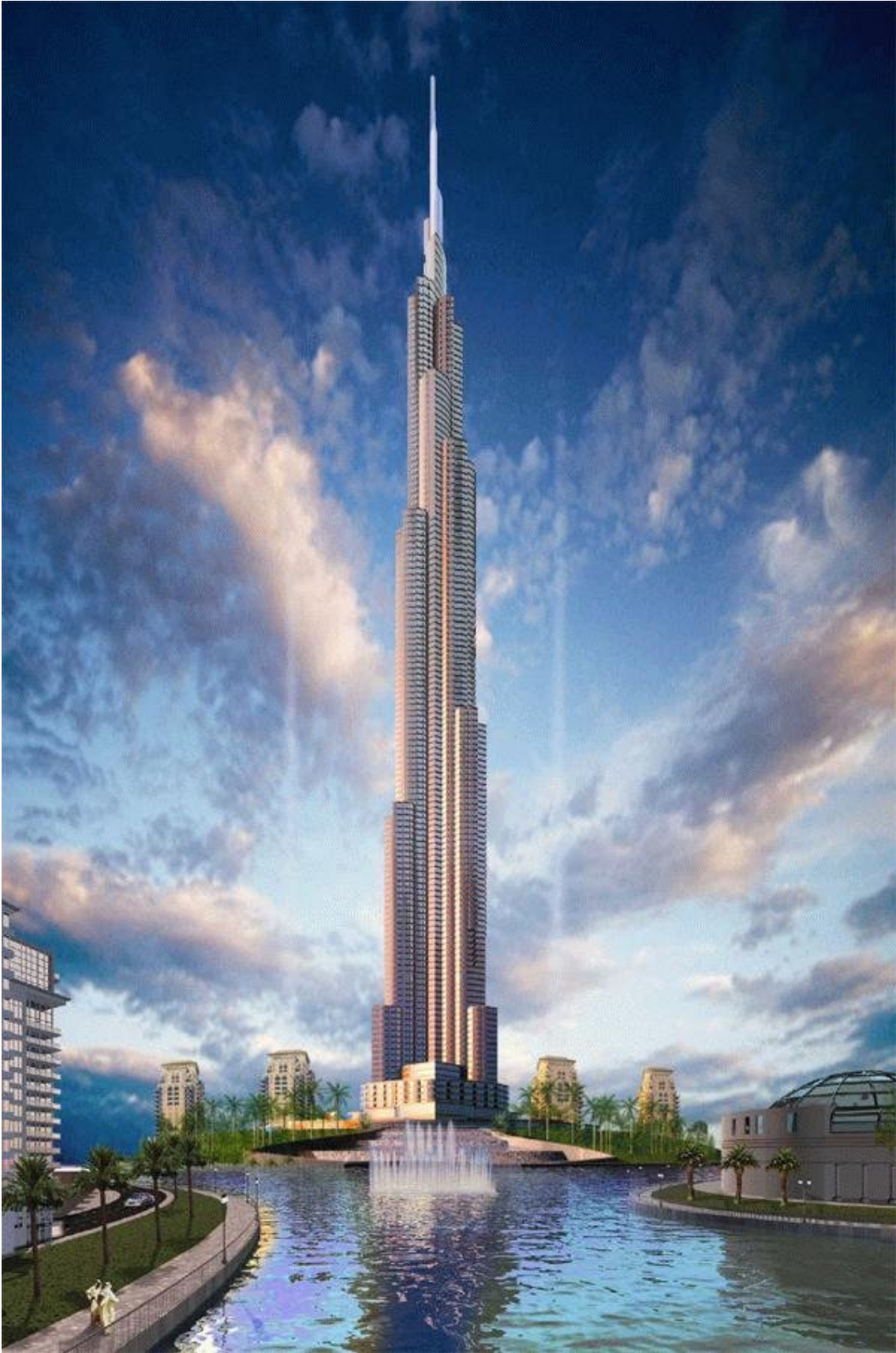
The Burj Dubai. Construction began in 2005 and is expected to be complete by 2008. At an estimated height of over 800 meters, it will easily be world's tallest building when finished. It will be