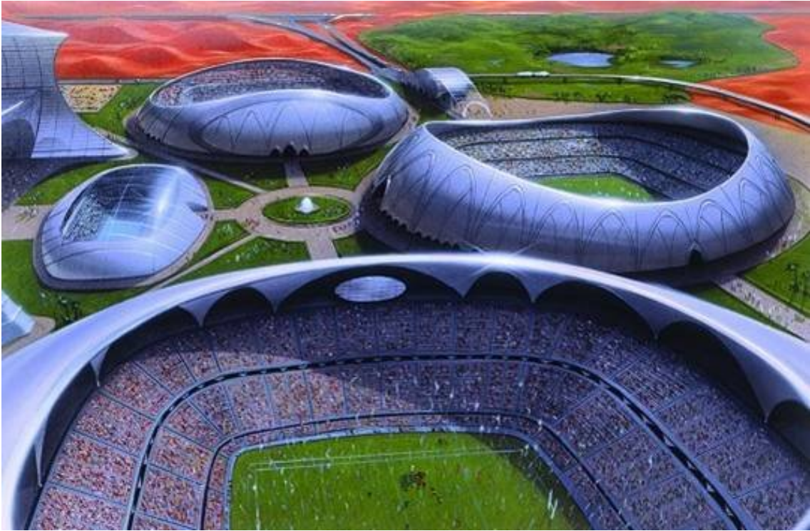
Dubai Sports City . A huge collection of sports arenas located in Dubai, UAE.